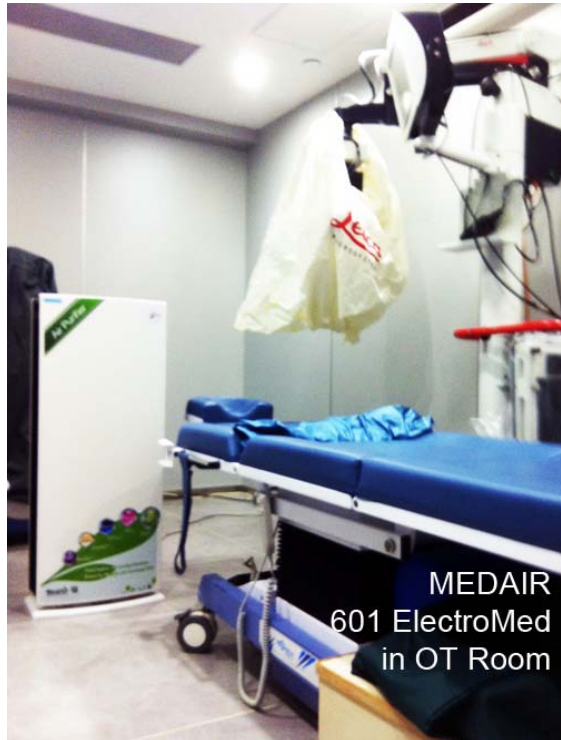
MEDAIR 601 ElectroMed in OT Room

OT Room apply MEDAIR 601 ElectroMed for air sanitizing purpose during the daily clean and sanitizing schedule.