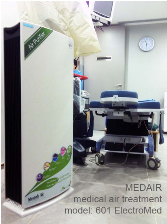
MEDAIR medical air treatment model: 601 ElectroMed

... medical air treatment unit by MEDAIR